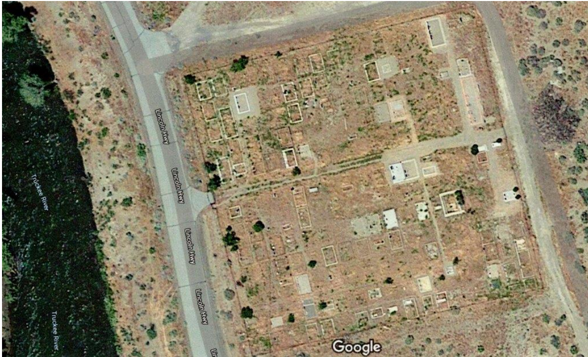
Wadsworth Fraternal Cemetery, (Scale 1 inch = ~80 feet; from Google Maps)