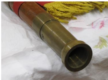
Screw joint in upper flag staff.