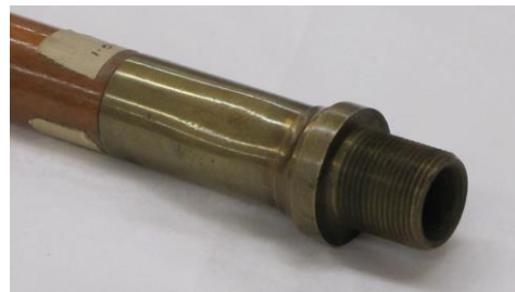
Screw joint in lower flag staff.