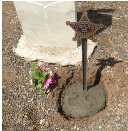
Camp 25 - for posterity