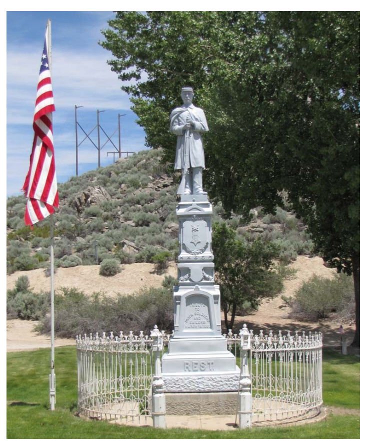
Civil War statue - Custer Post 5 plot