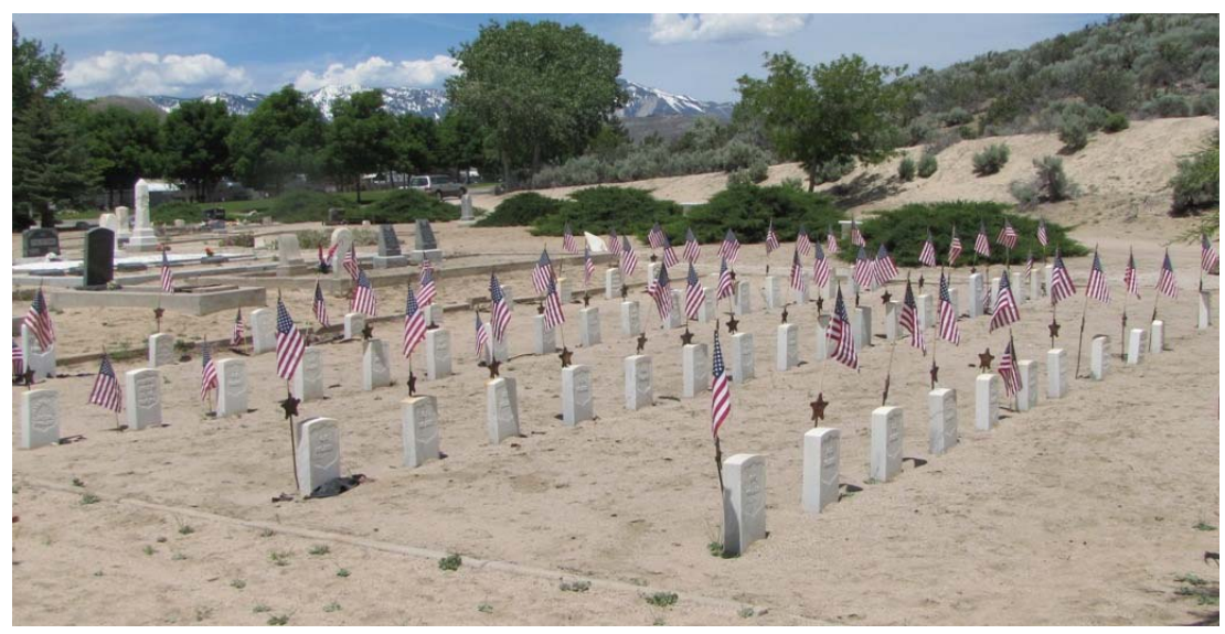
Fort Churchill soldiers section