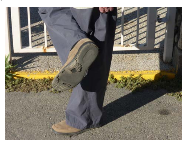
Brian wore out a pair of shoes on the expedition!