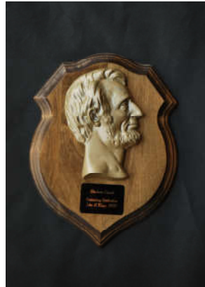
Abraham Lincoln Award - 2015