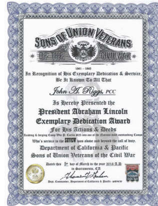
Abraham Lincoln Certificate - 2015