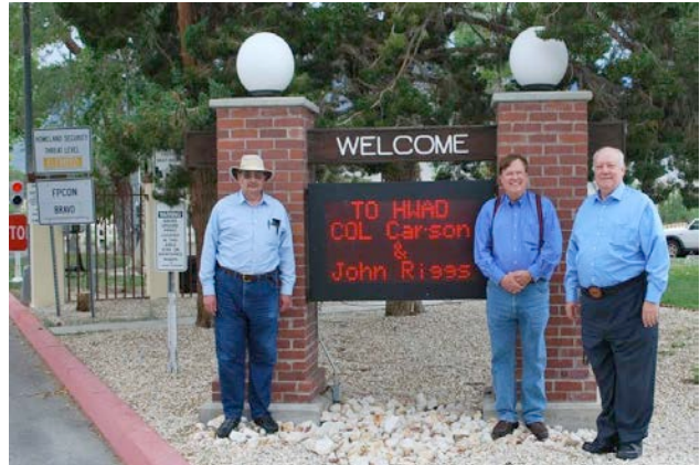
Entrance to Hawthorne Army Depot