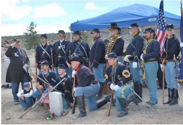
Nevada Civil War Volunteers