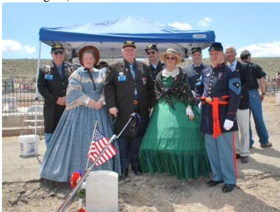
Ladies and Camp 25 officers

The story was picked up by both the local and national news. Through the Associated Press, the event went across the country, and around the globe. Besides the local media, other places reporting included, but were not limited to: Beaumont Enterprise , Texas; Contra Costa Times , California; Daily Mail , England; DemocraticUnderground.com ; Gettysburg Times , Pennsylvania; The Huffington Post ; Kansas Public Radio , University of Kansas; KATV, Channel 7, Arkansas; KTUL, Channel 8, Oklahoma; Michigan Chronicle , Michigan; National Post , Canada; News One for Black America; ; New York Times , New York; One News Page , England; The Orange County Register , California; Saigon Broadcasting Television Network, California; Samoa News , American Samoa; San Jose Mercury News , California; Singapore News , Singapore; Sioux City Journal , South Dakota; The Spokesman-Review , Washington; Veterans Affairs Media Summary and News Clips ; TheVeteranSite.com ; The Washington Times , Washington, DC.