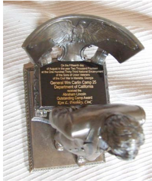
Plaque on the award.