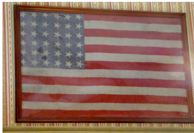
36-star flag at Bowers Mansion