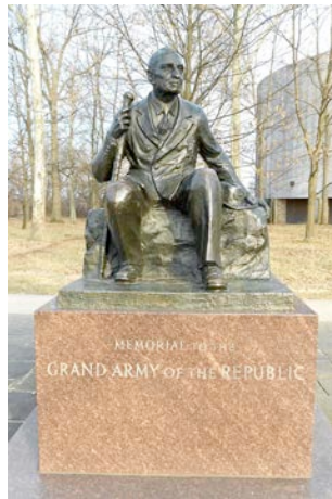
Albert Woolson's Monument at Gettysburg.

In 1954 he signed a deed of conveyance to turn over all GAR property to the Sons of the Union Veterans of the Civil War (SUVCW).