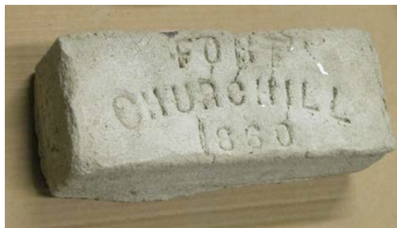
Fort Churchill adobe brick