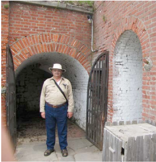
Entrance to POW quarters