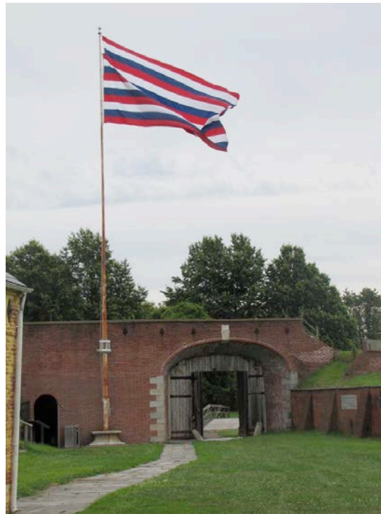
Fort Mifflin Flag