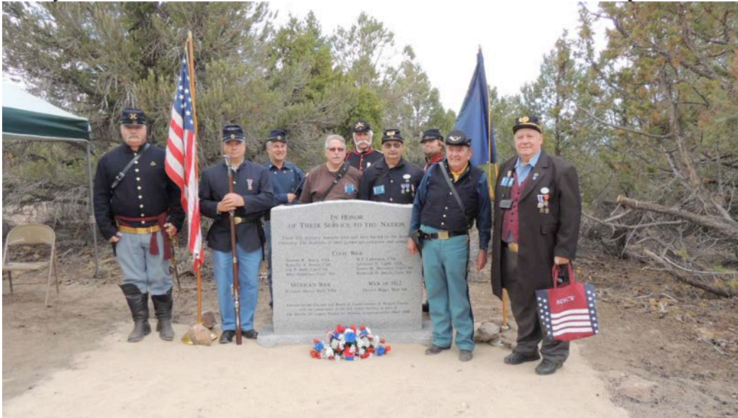
Camp 25 Members at Aurora, NV Monument Dedication