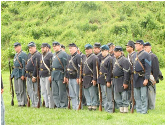
Civil War Reenactors