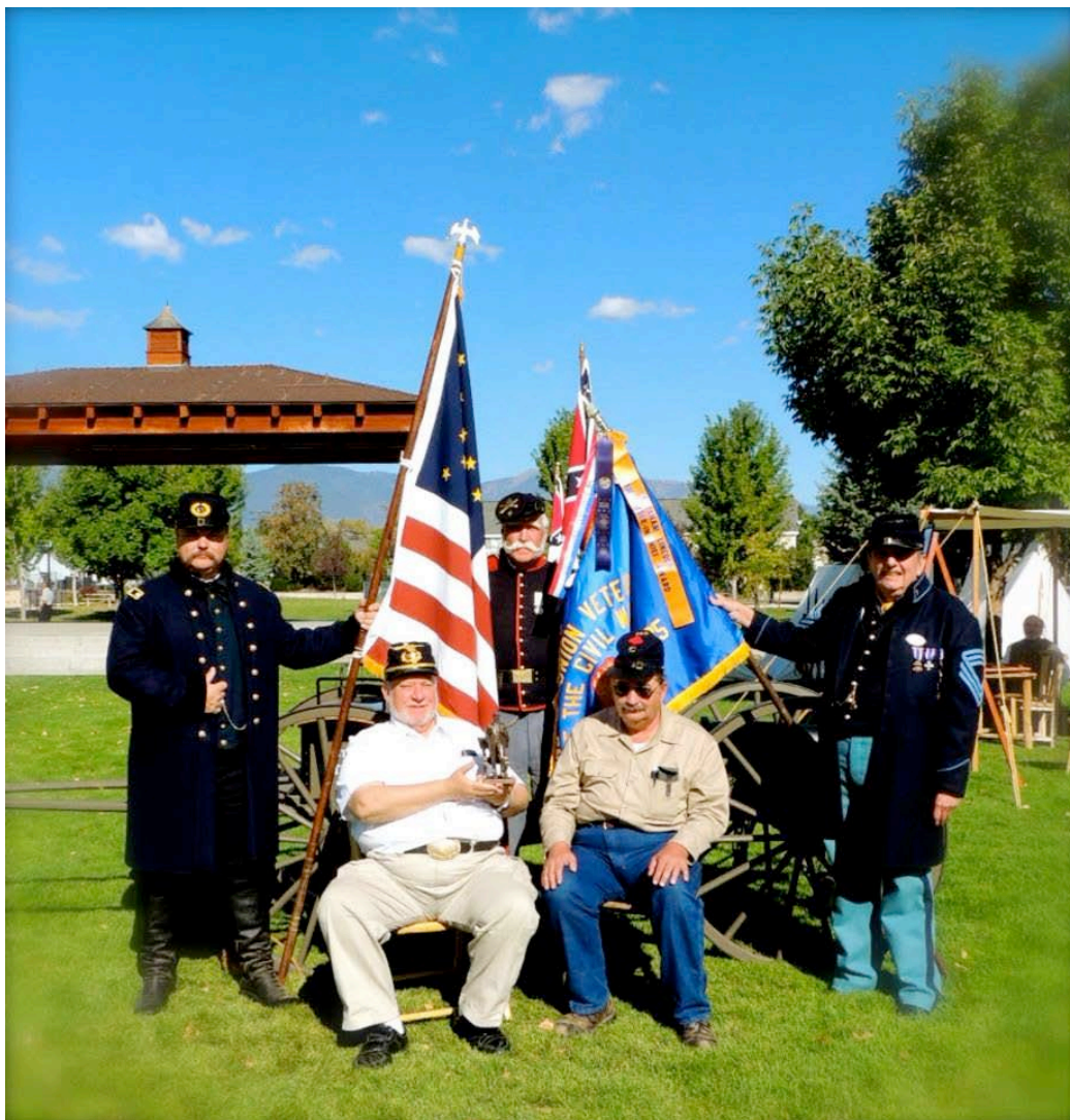
Camp 25 Members with Abraham Lincoln Award and Campaign Ribbons