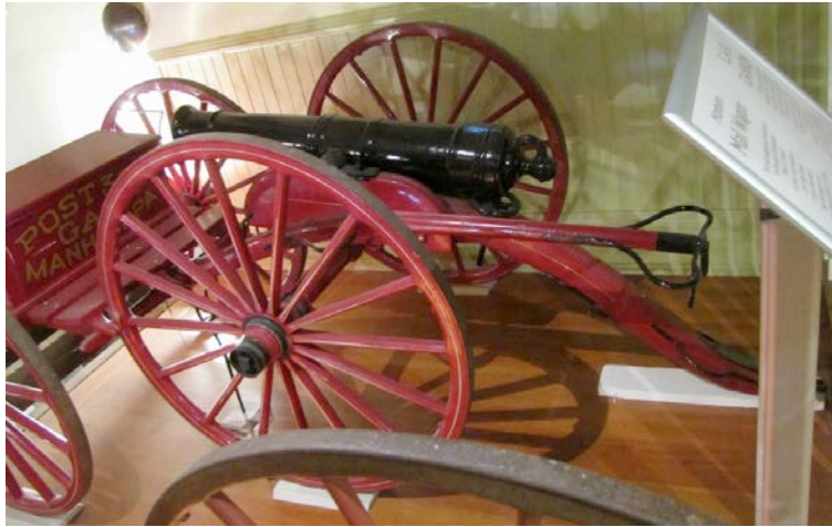
Pennsylvania G.A.R. Post 300 cannon and limber