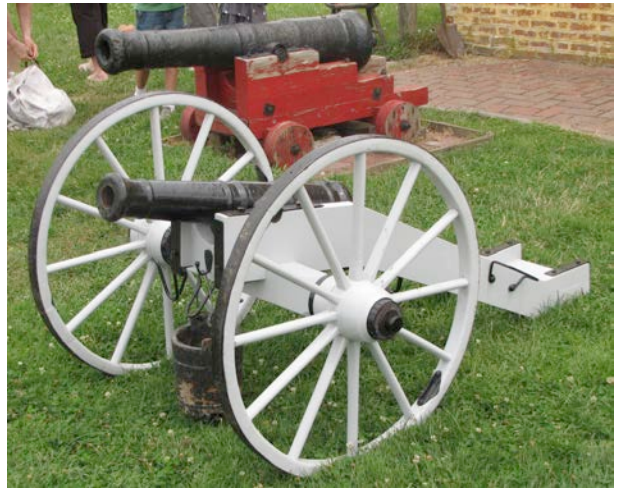
230-year-old operating cannon