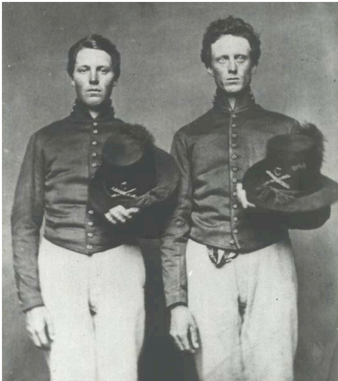
Photo 1-Light Artillery Enlisted Uniform

Until next time, Huzzah for the Federal Artillery!