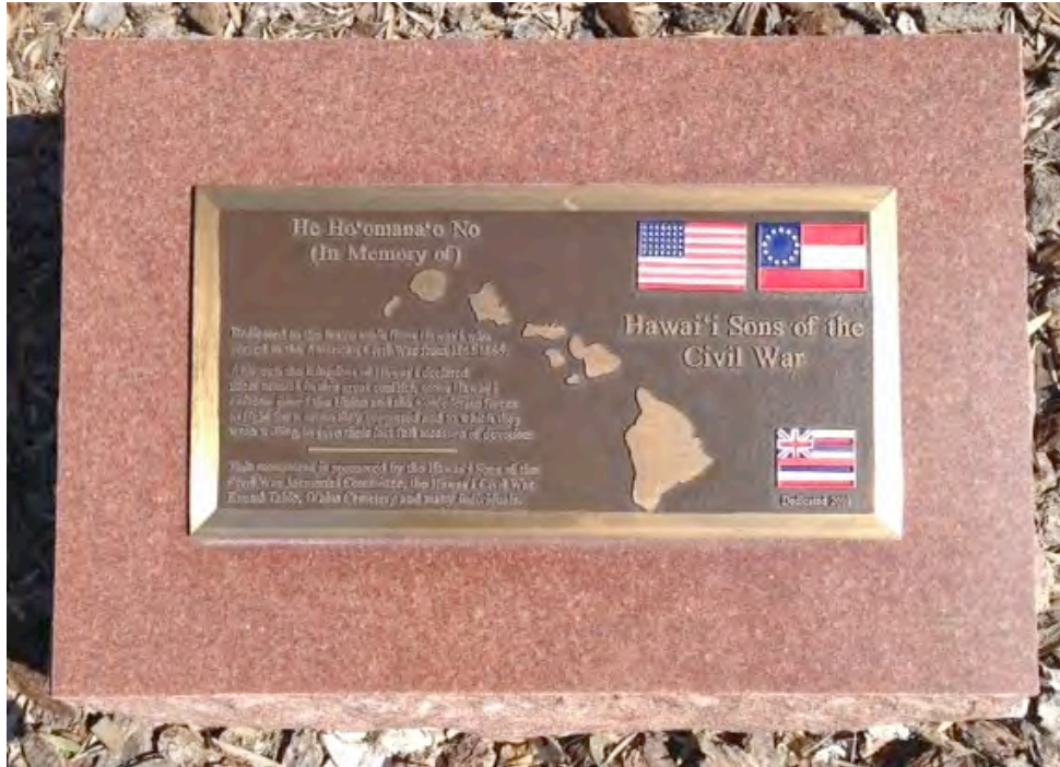
Hawai'i Sons of the Civil War.