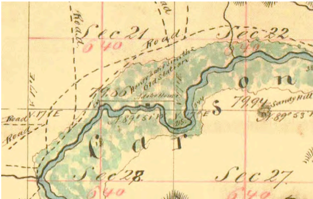
1865 Public Survey map showing Honey Lake Smith Station (old Williams Station)

After the visit to the Williams Station site, we explored a road running north from Wadsworth towards the site of the Paiute Indian War of May 1860 on the east side of the Truckee River. However, it was gated a couple of miles south of the site. We decided not to try our luck since it was on the Reservation.