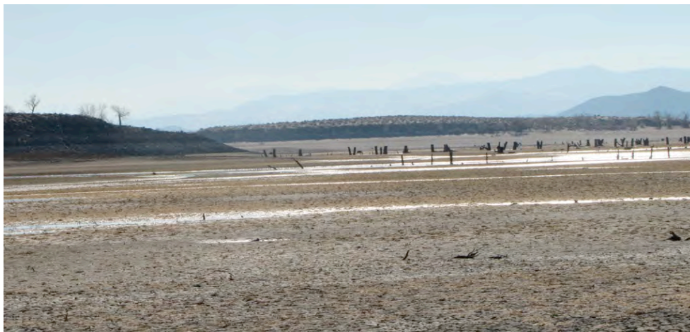
Approximate site of Williams Station.