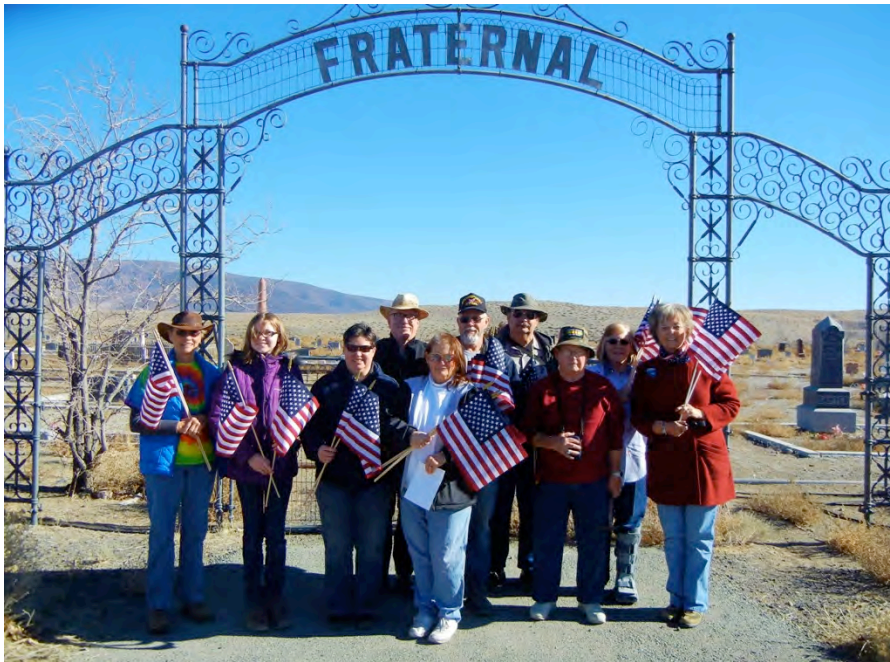
Group picture at the Wadsworth Fraternal Cemetery

and damaged flags were replaced on graves with them. The adjacent Indian cemetery also contains graves of veterans, but special permission from the tribe was needed to replace the flags there.