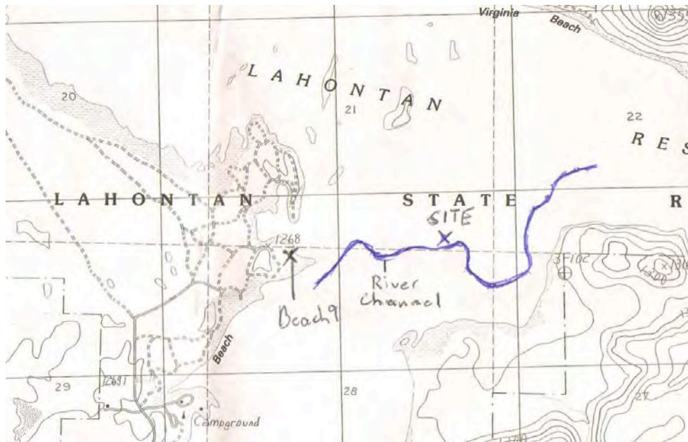
Approximate site of Williams Station on modern topographic map.