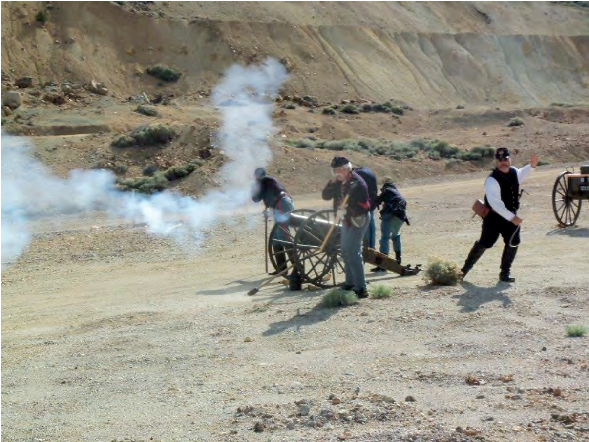
Mountain Howitzer in action at Virginia City, NV reenactment 2013.

It is critical to Camp 25 and Battery A members to become familiar with the basics of this weapon. We hold annual training and require safety tests prior to serving on the gun crew, however all members are welcome to participate. Please contact Battery Commander at trainingchief@firehousemail.com to become qualified.