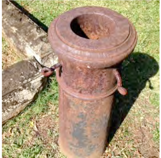
One of the very rusty cannons marking the perimeter of the G.A.R. plot.