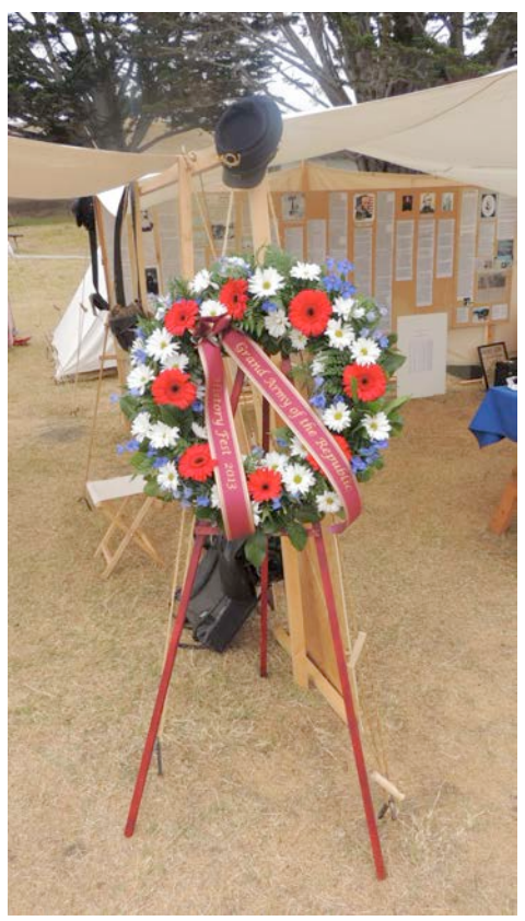
GAR Wreath at Fort Mervine