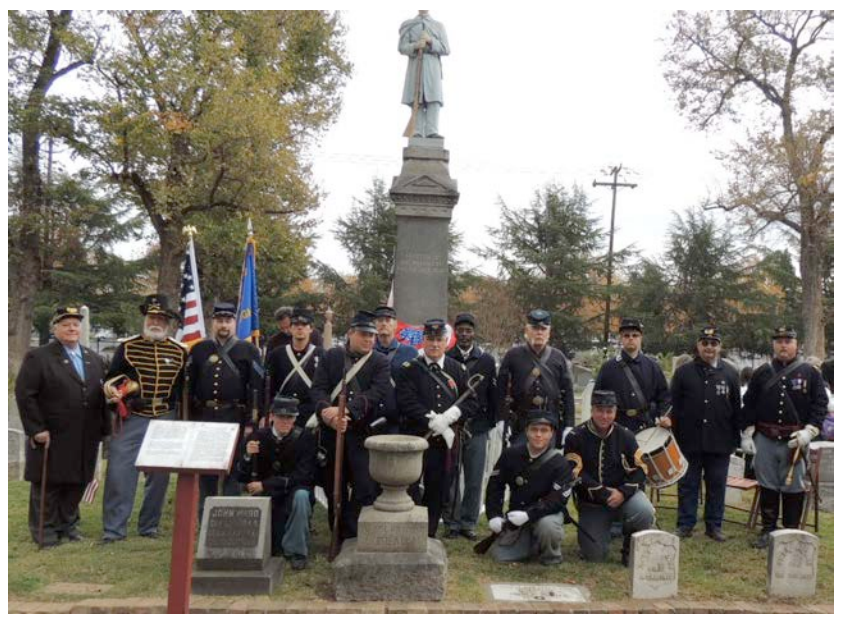
Camp 25 and DPFB members at Sacramento Event.

The George Wright Camp 22 of Sacramento, CA hosted an event to honor the 150<sup>th</sup> anniversary of this solemn occasion. Camp 25 and Battery A, 3<sup>rd</sup> US Artillery were well represented at this event, and additional support was received from Co. K, 81<sup>st</sup> PA Infantry of the Department of the Pacific, Federal Battalion.