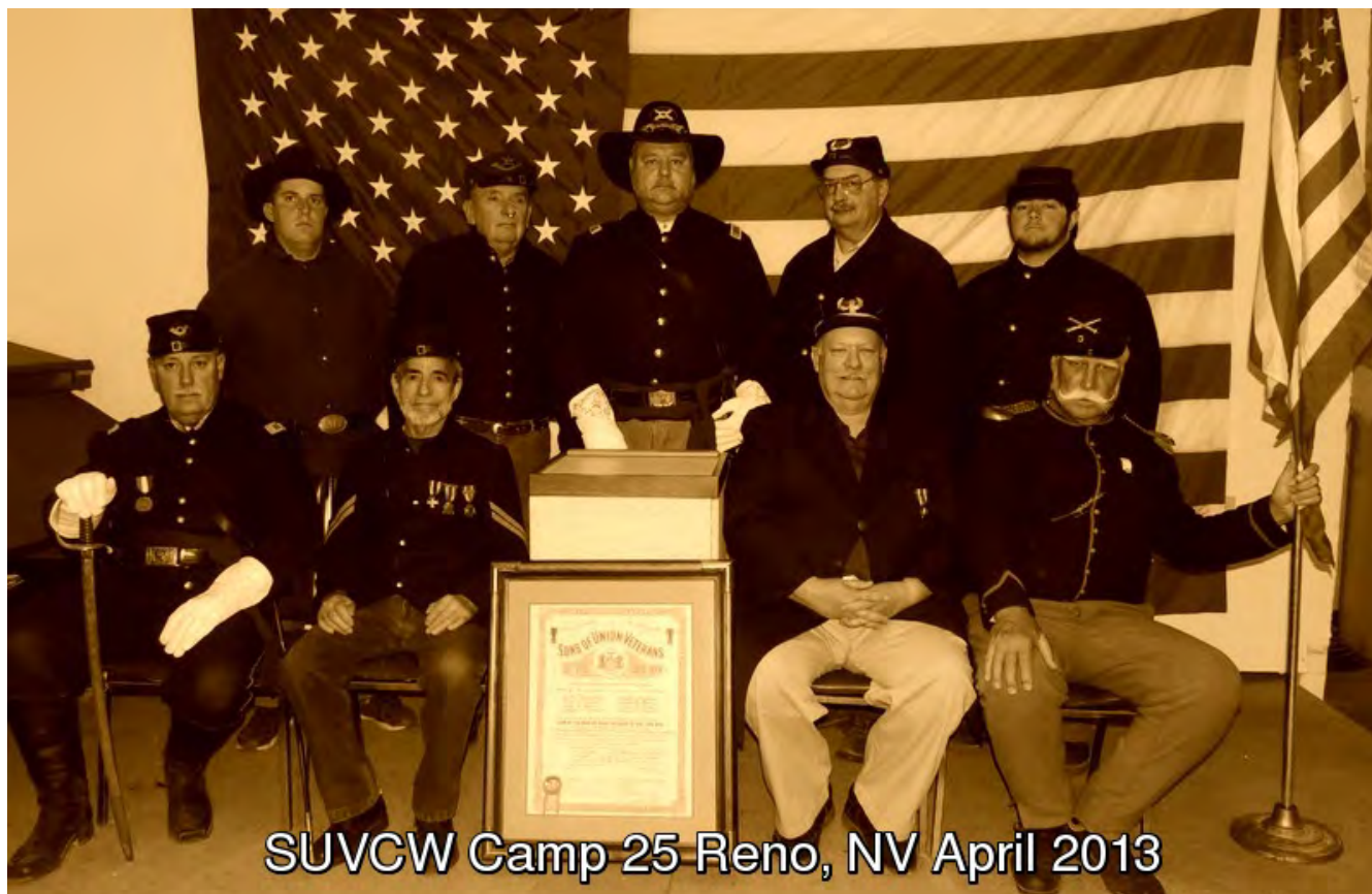
SUVCW Camp 25 Reno, NV April 2013