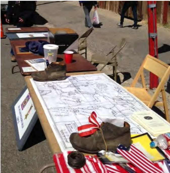
Carlin Camp 25 display.