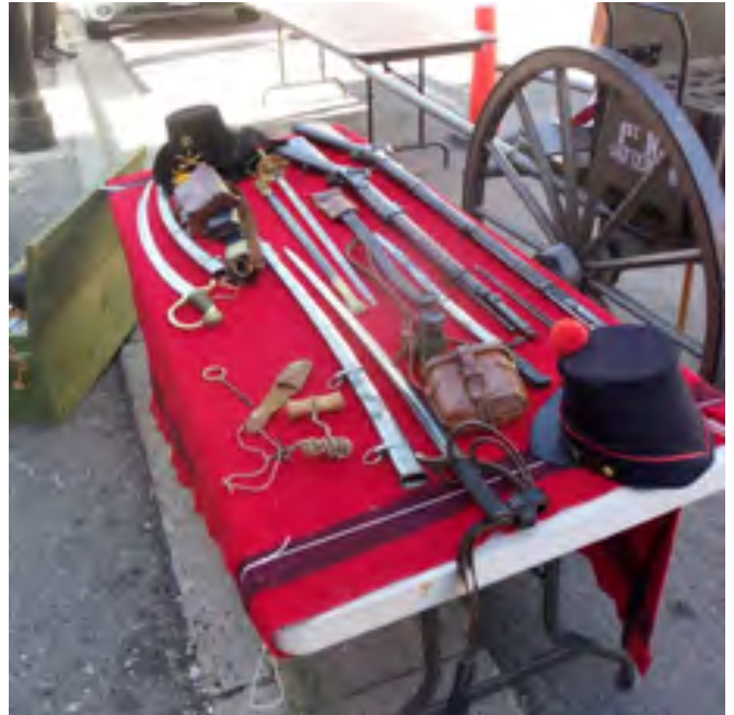
Display of Ray Ahrenholz's collection.