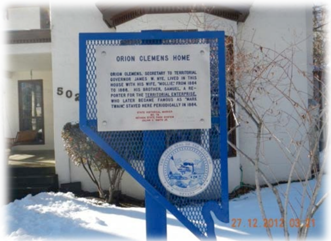
Nevada Historical Marker by Clemens home.