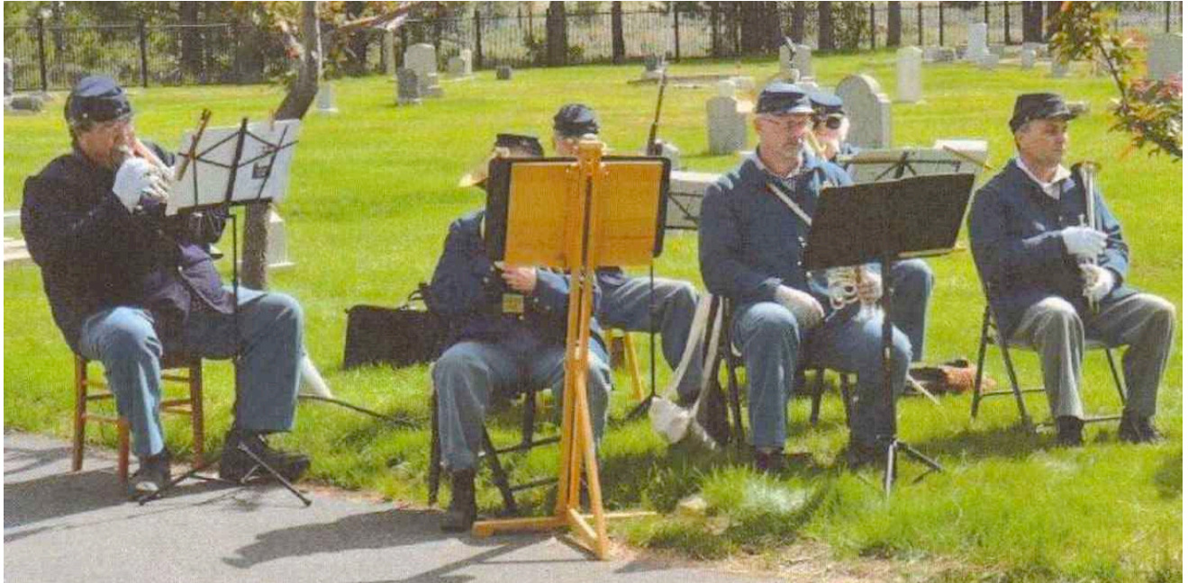
Fort Point Garrison Civil War Band