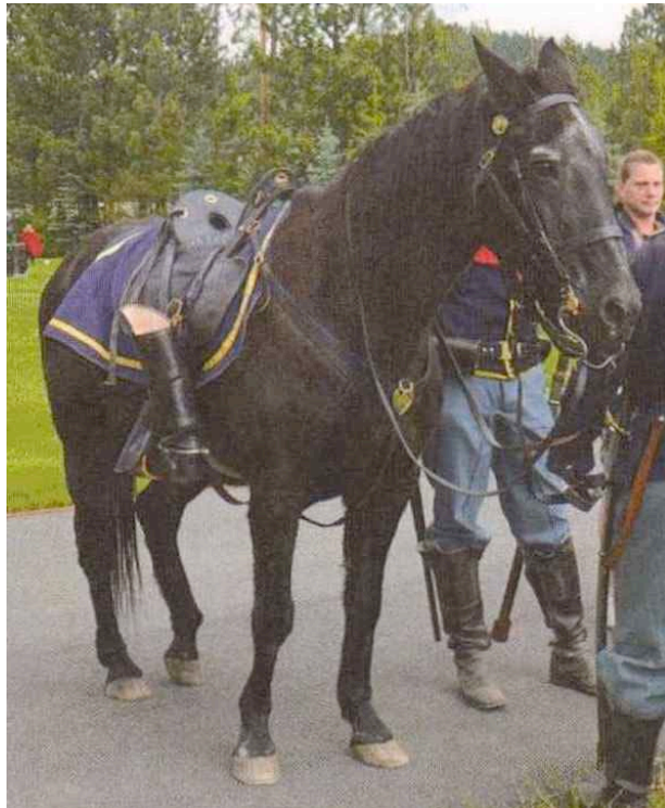
Whisky the riderless horse.