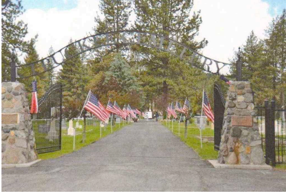
Sierra Mountain Cemetery, Truckee, California