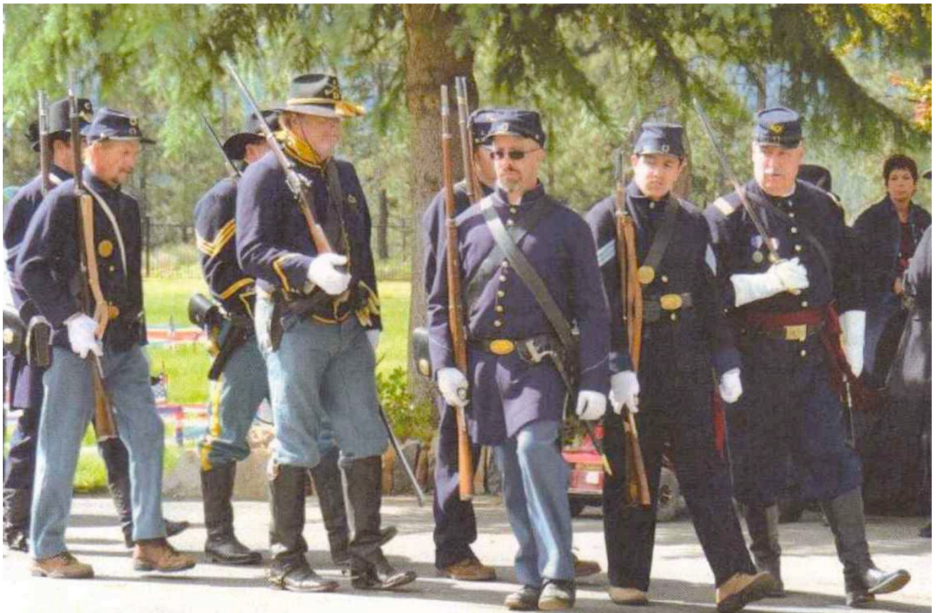
Marching in of the troops.