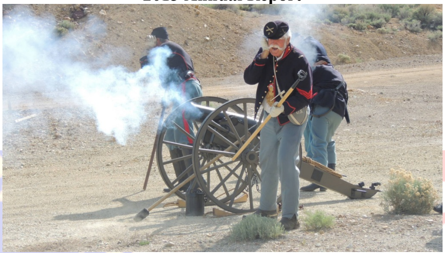
Cannon Fire Gold Hill, NV 5/13