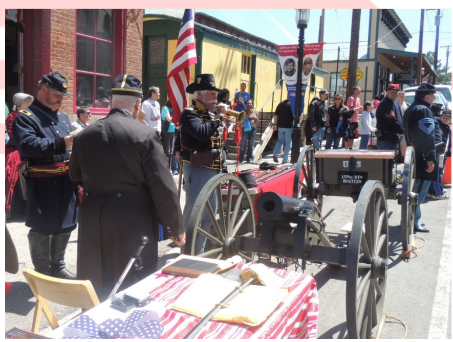
Virginia City Display 5/13

Chief of Staff-6<sup>th</sup> Military District, SVR