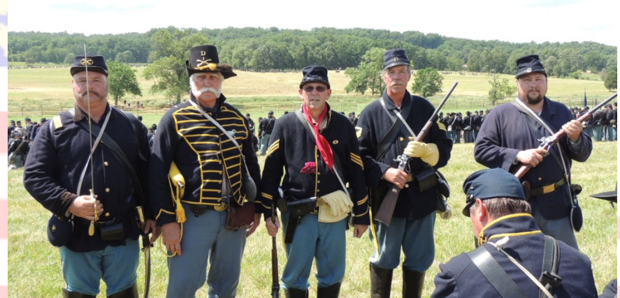
Nevada Reenactors/SVR Members at 150th Gettysburg 7/13