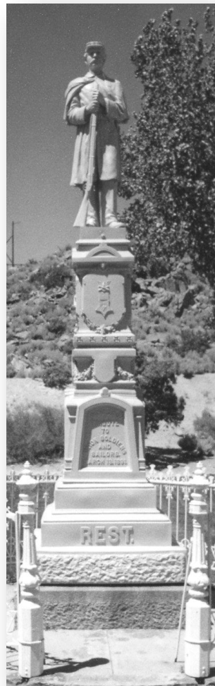
Nevada's Tribute to Union Soldiers and Sailors, March 19, 1891 at Lone Mt. Cemetery, Carson City.

Custer Post No. 5; Lone Mountain Cemetery General O. M. Mitchel Post No. 69; Hillside Cemetery McDermitt Post No. 87; Pioneer Cemetery