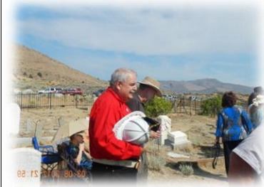
Gardnerville Civil War Days. Sattley CA Cemetery excursion. Jones stone dedication Gold Hill, NV.