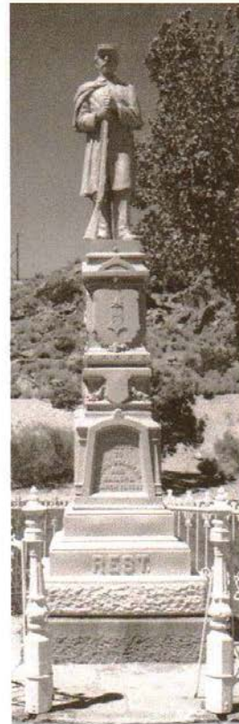
"Nevada's Tribute To Union Soldiers and Sailors, March 19, 1891" Lone Mtn. Cemetery, Carson City, Nevada

Custer Post No. 5; Lone Mountain Cemetery General O. M. Mitchel Post No. 69; Hillside Cemetery McDermitt Post No. 87; Pioneer Cemetery