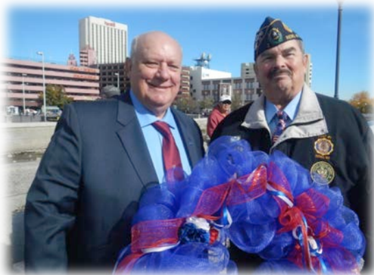
The wreath that was dropped in the Truckee River by Post #1 of the American Legion in Reno.