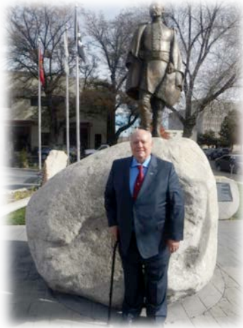
General Reno Monument downtown Reno. 150 th Anniversary of Nevada in the War of the Rebellion. Nevada became the 36 th State in the Union as “Battle Born.”