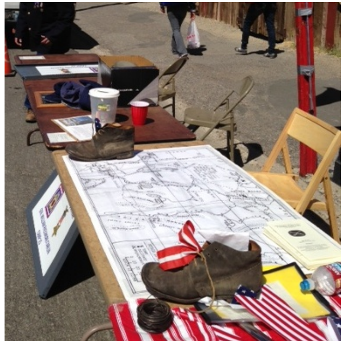
Carlin Camp 25 display.