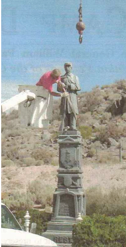
Disassembly beginning on July 19, 2004.