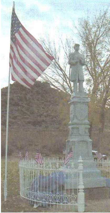
Monument after its return