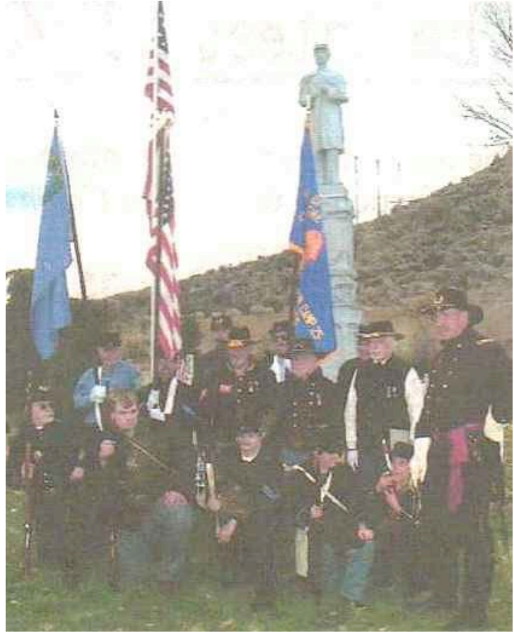
Members of the SUVCW color guard pose in front of the monument after the rededication.

For background information, as noted earlier, the statue was originally acquired and dedicated on Memorial Day in 1891 by the Grand Army of the Republic Custer Post 5. The statue is 17 feet tall and includes a 6-foot statue of a Union soldier at “parade rest”. The monument is hollow and made of “white bronze” (zinc), and was manufactured by the Monumental Bronze Co. of Hartford, Connecticut. The company quit making such monuments in 1914. A detailed history involving the statue can be found on the Camp History Page under “Grand Army of the Republic Custer Post No. 5 Cemetery”, by David A. Davis, Camp Historian/Civil War Memorials Officer.