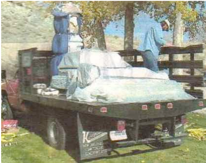
Return of the monument on November 10, 2004