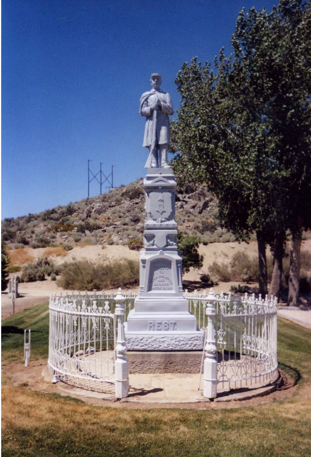
Nevada's Tribute To Union Soldiers and Sailors, March 19, 1891