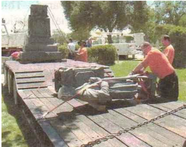
Preparations to ship the monument to Ohio.