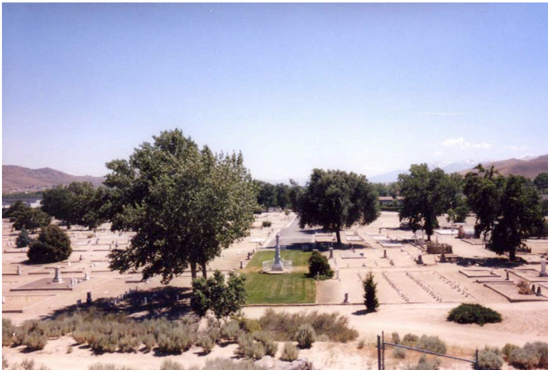
Custer Post 5 cemetery plot in the Lone Mountain Cemetery Complex, Carson City, Nevada. View is looking south from the slope of Lone Mountain. The driveway at one time was the northern end of Roop Street. The statue, which faces south, is in the center of the plot.