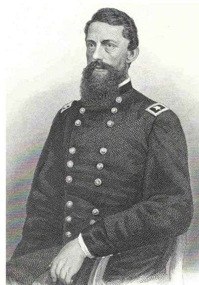
General George Stoneman Jr. Camp 18 Officers

All General Orders can be viewed in their entirety at; www.suvcw.org/?page_id=513