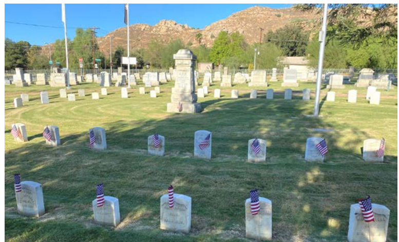
Above; Flags placed at the G.A.R. Circle in Evergreen Memorial Historical Cemetery, Riverside, CA. for Veterans Day 11/10/2020.