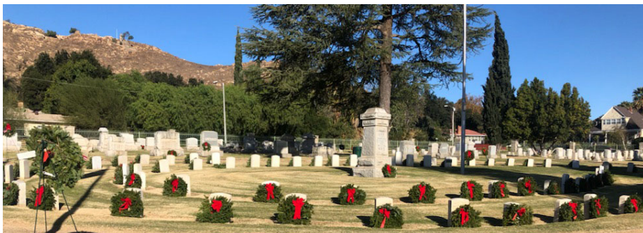
Photo above; wreaths adorn the headstones in the G.A.R Circle at Evergreen Cemetery on 12/15/2020.