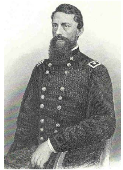
General George Stoneman Jr. Camp 18 Officers

Best of luck to our Department's newest Camp Senator Edward Dickinson Baker Camp #31.