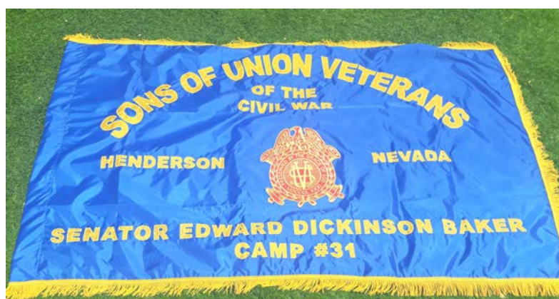
Photo above; recently received camp flag for the Department's newest camp #31.

On another membership note, I know we are still in September but just a reminder that annual membership Dues renewal requests will be going out in the mail at the end of November.