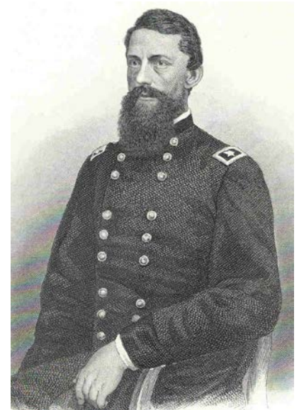
General George Stoneman Jr. Camp 18 Officers

Here is a list of schools that Camp 18 has issued Sons of Union Veterans of the Civil War JROTC awards for this year: Army JROTC at Carter High School in Rialto; Air Force JROTC at Vista Murrieta H.S. in Murrieta; Marine Corps JROTC at Murrieta Valley H.S. in Murrieta; Air Force JROTC at Moreno Valley H.S. in Moreno Valley; Air Force JROTC at La Quinta H.S. in La Quinta; Army JROTC at Kaiser H.S. in Fontana; Navy JROTC at Corona H.S. in Corona and Army JROTC at Waimea H.S. in Waimea, Hawaii.