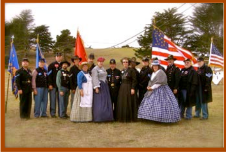
above is the Dept of Calif. & Pacific Participants 8 Camps & 3 Auxiliaries

"In Photo below, Members of the Sons of Veterans Reserve firing a three fire volley demo on Saturday Oct 8th."