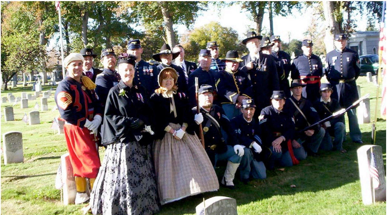
At Oak Hill Memorial Park Cemetery in San Jose. SUVCW – ASUVCW- DUVCW – ACWA.